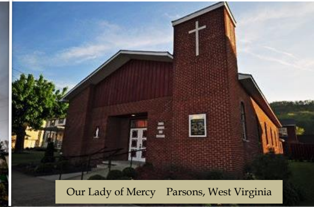
Our Lady of Mercy Parsons, West Virginia