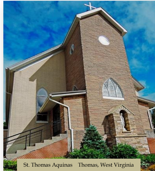
St. Thomas Aquinas Thomas, West Virginia