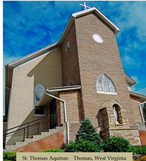
St. Thomas Aquinas Thomas, West Virginia