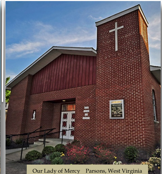
Our Lady of Mercy Parsons, West Virginia