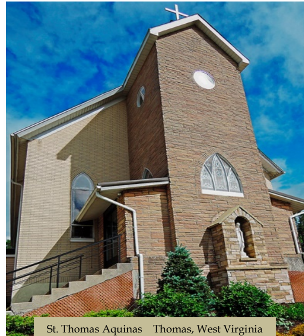
St. Thomas Aquinas Thomas, West Virginia