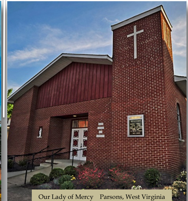
Our Lady of Mercy Parsons, West Virginia