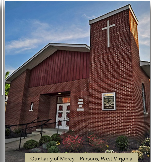
Our Lady of Mercy Parsons, West Virginia