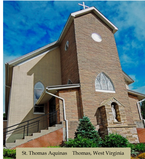
St. Thomas Aquinas Thomas, West Virginia

We offer a hearty welcome to all of our visitors! If you would like to make a contribution to our parish, please use the visitor's envelope in the pew.