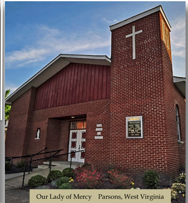
Our Lady of Mercy Parsons, West Virginia