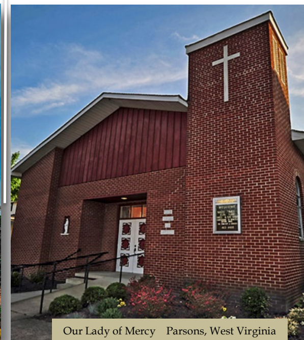
Our Lady of Mercy Parsons, West Virginia