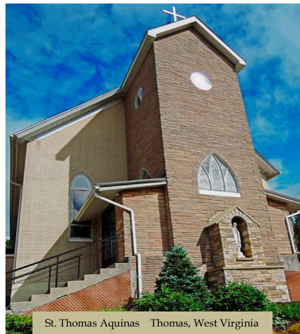
St. Thomas Aquinas Thomas, West Virginia