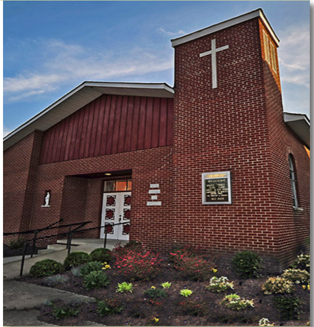
Our Lady of Mercy - Parsons, West Virginia