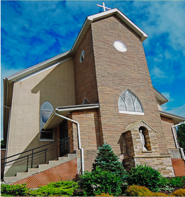
St. Thomas Aquinas - Thomas, West Virginia