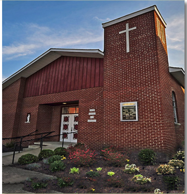
Our Lady of Mercy - Parsons, West Virginia