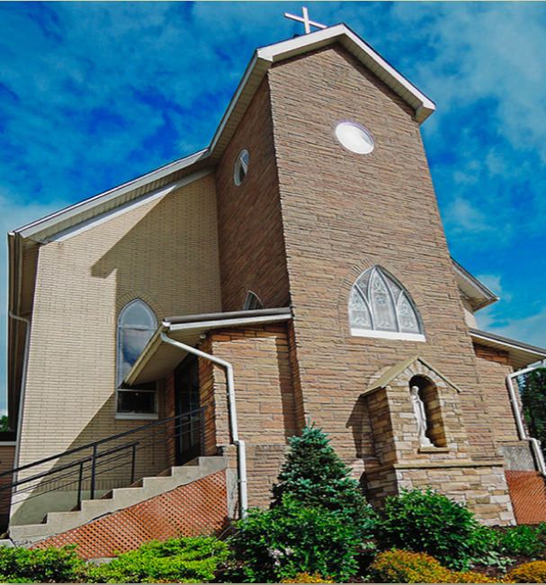
St. Thomas Aquinas - Thomas, West Virginia