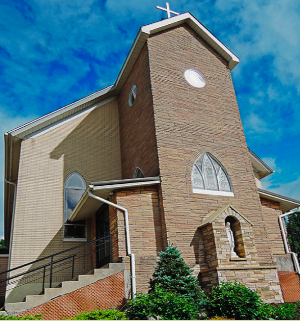
St. Thomas Aquinas - Thomas, West Virginia