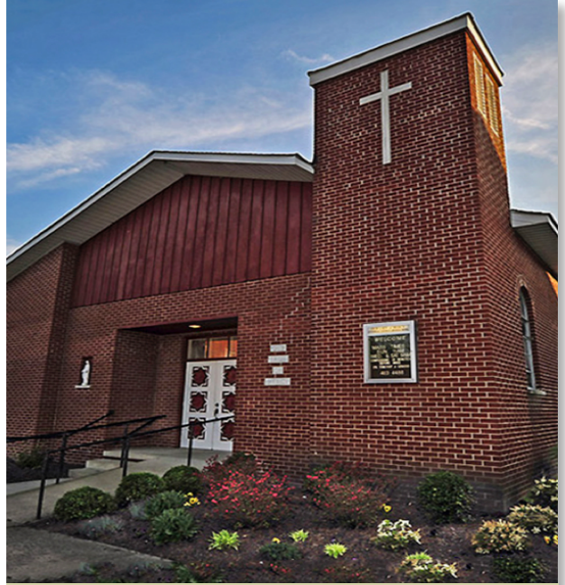
Our Lady of Mercy - Parsons, West Virginia