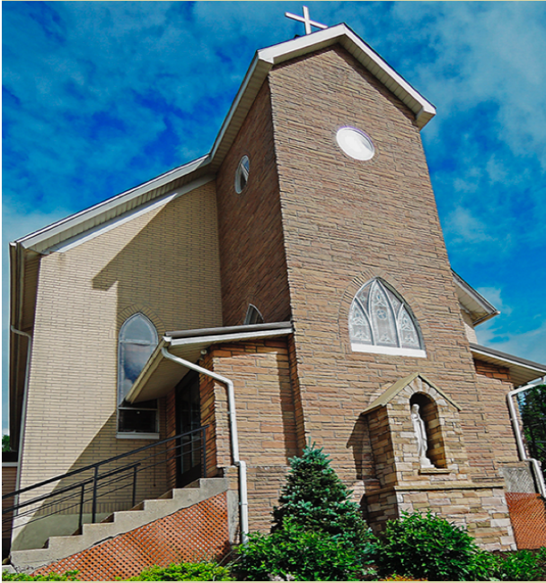
St. Thomas Aquinas - Thomas, West Virginia