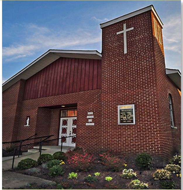
Our Lady of Mercy - Parsons, West Virginia