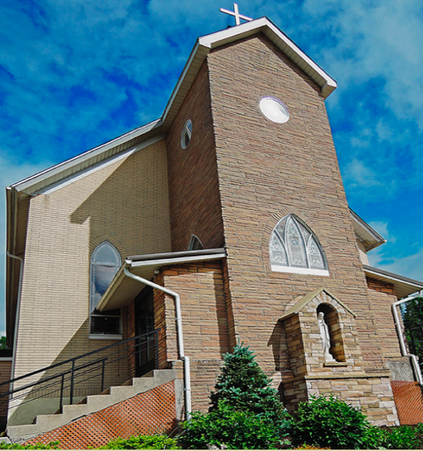
St. Thomas Aquinas - Thomas, West Virginia