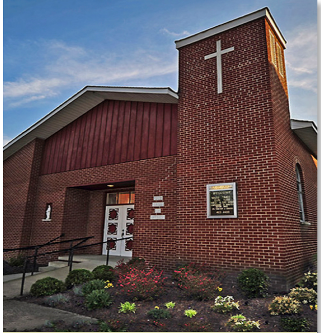
Our Lady of Mercy - Parsons, West Virginia