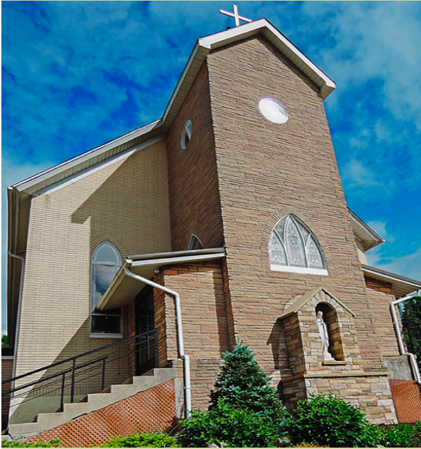
St. Thomas Aquinas - Thomas, West Virginia