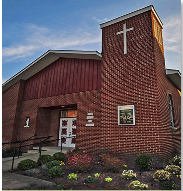
Our Lady of Mercy - Parsons, West Virginia