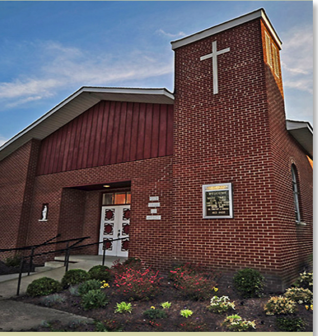
Our Lady of Mercy - Parsons, West Virginia