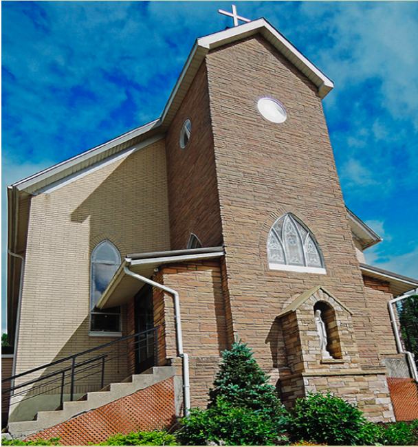
St. Thomas Aquinas - Thomas, West Virginia