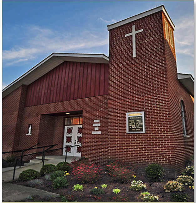
Our Lady of Mercy - Parsons, West Virginia